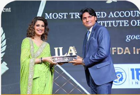
Most Trusted Accounts & IT Training Institute