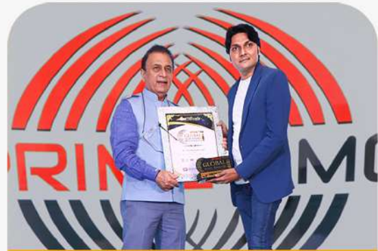
Entrepreneur Of The Year 2021-22