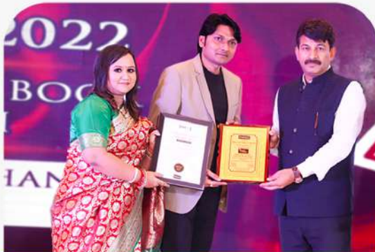
Best Accounts & IT Training Institute