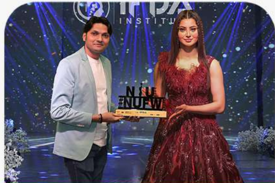
Accounts & IT Training Institute of Delhi